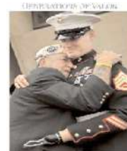
Generations of Valor