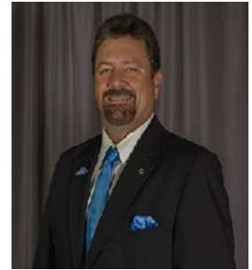
Governor Alan D. Guire

TO DIVISION 35 SUNDAY, MARCH 22, 2014 $40.00 per person DIAMOND BAR GOLF COURSE 22751 GOLDEN SPRINGS DRIVE DIAMOND BAR, CA 91765