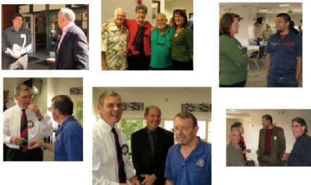
Kiwanis Photo Album