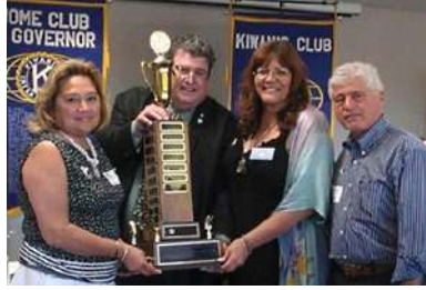
Duarte – Club of the Year