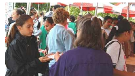
Kids going through the Kiwanis "Souvenir Booth" for free gifts