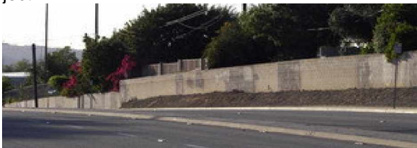
Before: Uneven wall color due to varied graffiti paint-over

Kiwanis One Day has grown from the seeds that were planted a few years back in Cal-Nev-Ha's Total-K Day. Previous events by our club have included tree planting both locally and in our Upper San Gabriel Valley watershed areas. One year we spent several days refurbishing a local home. This year we wanted to keep the project local and something that would be of benefit to the community at large. We went to our LA County Supervisor's office asking what we as a club could do for the community on April 5th for our Kiwanis One Day. Our project was to paint a section of gray-colored concrete block wall along Halliburton. 43 gallons of interior gray paint was given to us along with paint kits (plastic tray, roller, brush & latex gloves) by the LA County for this project.