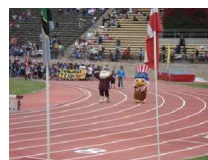
Sam the Eagle and friend at the opening ceremonies

At this annual event all competitors engage in 1 to 3 track and field events that teach sportsmanship and healthy, friendly competition, including awarding the "Spirit" Award to the team that best embodies support for your team, encouraging your fellow athletes and others, and in general, showing the good character expected of an athlete and his/her team. Over these 23 years, some 280,000 youth have competed in the Youth Days events.