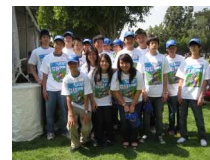
Key Clubbers between events