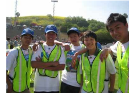
Key Clubbers "vesting" their efforts