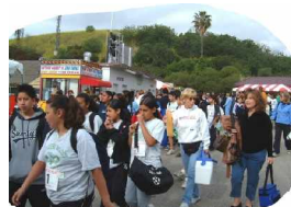
Part of the Crowd at Mt. SAC

For the 23 rd consecutive year, the Walnut Valley Club volunteered at the Mt. SAC Youth Days, this year working with some 6,800 children, grades 3 to 8, over 2 days, on April 4-5, 2008. Their Sponsored Youth Key Clubs from Diamond Bar and Walnut High Schools joined them both days, although on Friday it was after school had ended.