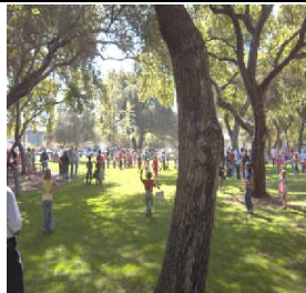
Some of the Crowd