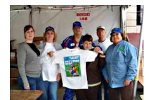
Walnut Valley and La Puente Industry Clubs at Mt. SAC Youth Days