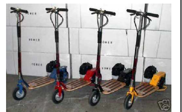
Two Yomers will be raffled off

4. On August 3rd we will have a drawing for "2 Yomer Scooters". This is our current fundraiser. Tickets will be available at our DCM meeting.