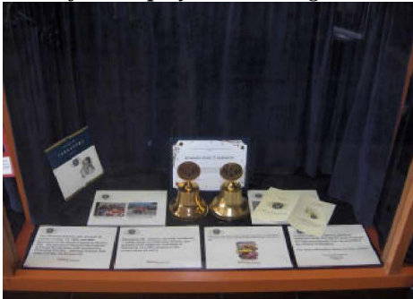
Just One Panel of the Display

Go in and check out our club display at the Glendora Library. We have the use of the display cases through the month of July.