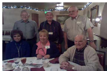
South Hill Club Interclub

At our June 4 th Meeting, we were pleased to have a 6-member Interclub from South Hills.